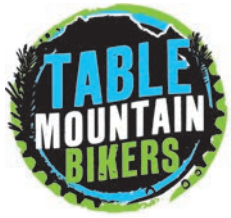
TABLE MOUNTAIN MTB ROUTE